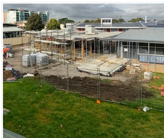
Year 9 Learning Centre

Some exciting news is that work is now well underway on the new Year 9 Learning Centre. This centre will be a great inclusion for our community and students will reap the rewards of this state of the art facility. This building will host nine homerooms, as well as two large collaborative learning spaces and numerous staff offices. The building and other new facilities recently opened at the College provide a rich and stimulating learning environment for all our students to flourish and reach their full potential. The Year 9 Learning Centre should be completed ready for the start of the 2021 school year.