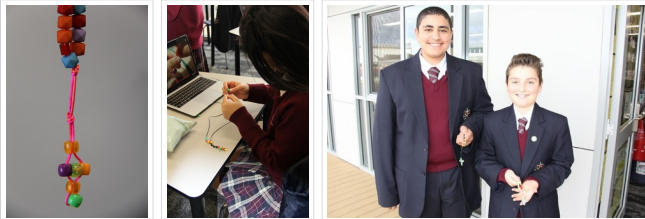
Year 7 Religious Education